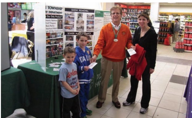
Families as well as many seniors stopped by the Highway Department booth at the Maine Township Senior Expo earlier this year. It is a great opportunity to answer questions and provide the public with valuable information.

Please report any street light outages or damaged signs in unincorporated Maine Township to the Highway Department at 847-297-5225.