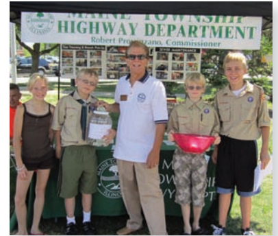
Commissioner Provenzano greeted local scout groups and many residents during the Taste of Park Ridge Family Day in Hodges Park.

Throughout Maine Township, there has been an unfortunate increase in gang activity and vandalism. It is important for you to report any suspicious activity to 911 immediately. When everyone works together with the local police departments, we can help stop this kind of activity from escalating. We also encourage your participation in our Gang Seminar at Maine Town Hall on Oct. 19. See Trustee's Corner in this edition for details or call 847-297-2510.